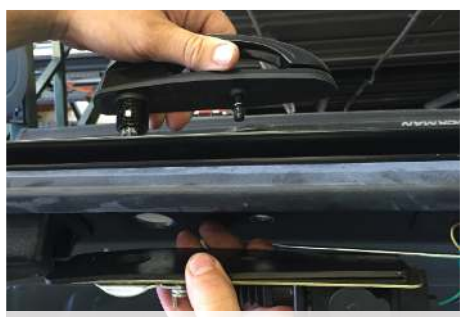
9. Pull the handle away from outside of the door, keeping hold of the backing plate.