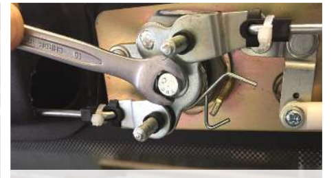
6. The centre screw can now be removed using the 10mm spanner. Remove the plate and slide off the rods C/W end plates and the return spring.