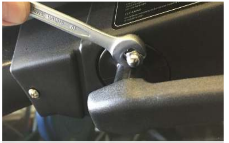
1. Use a 10mm spanner to remove the nuts that retain the door inner handle. Keep the locking washers.