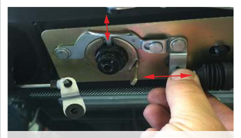
16. Extend and retract the actuator manually as shown. Check that this locks and unlocks the handle.