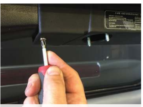
3. Remove the 2 screws that retain the inner cover using a Philips #2 driver.