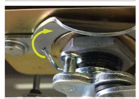
4. Disable the handle return spring by unhooking it from it's retaining lug.