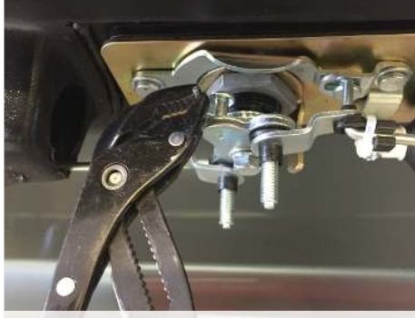
5. Use pliers or a pair of grips.