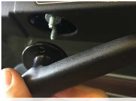
2. The handle can be taken off it's mountings.