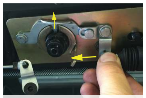
8. Extend the actuator as shown above, this will release the locking pin from the mechanism.