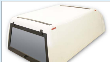
1 x Truckman Classic High Roof Hardtop