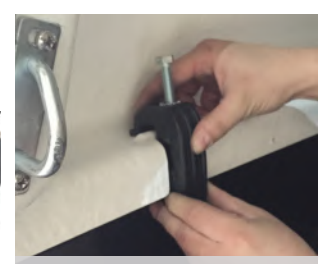
15. Assemble the clamps, as shown, in the recesses of the side rails.